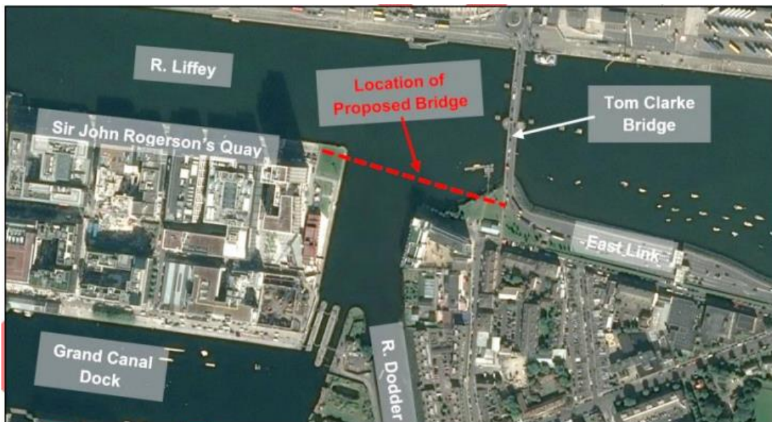
Figure 1: Location of the proposed Dodder Public Transportation Opening Bridge

The proposed Dodder Public Transportation Opening Bridge is a three-span bridge which will span from Sir John Rogerson's Quay to the R131 adjacent to Tom Clarke Bridge. The bridge will accommodate pedestrians, cyclists, buses and taxis. The bridge accommodates an opening section adjacent to Sir John Rogerson's Quay which facilitates navigation of vessels between the river Liffey and the river Dodder / Grand Canal Basin. In the closed position, the bridge will accommodate a navigation envelope to permit the passage of small boats. An opening span is required to permit the passage of larger vessels between the Dodder River / Grand Canal Dock and the Liffey River.