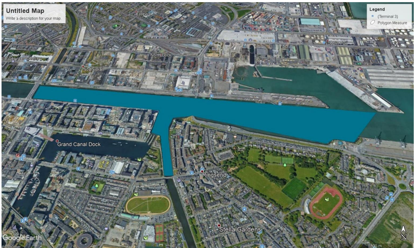
Figure 4. Proposed Mitigation Zone (1000m) as recommended by NPWS (2014)

Potential mitigation measures during the piling operation are limited. Similar activities both nationally and internationally have been monitored through the provision of a Marine Mammal Observer (MMO) who ensures that there are no marine mammals within a pre-agreed distance prior to piling during daylight hours. The MMO can also record any reaction to the piling operation. However, this mitigation measure will only be effective during daylight hours.